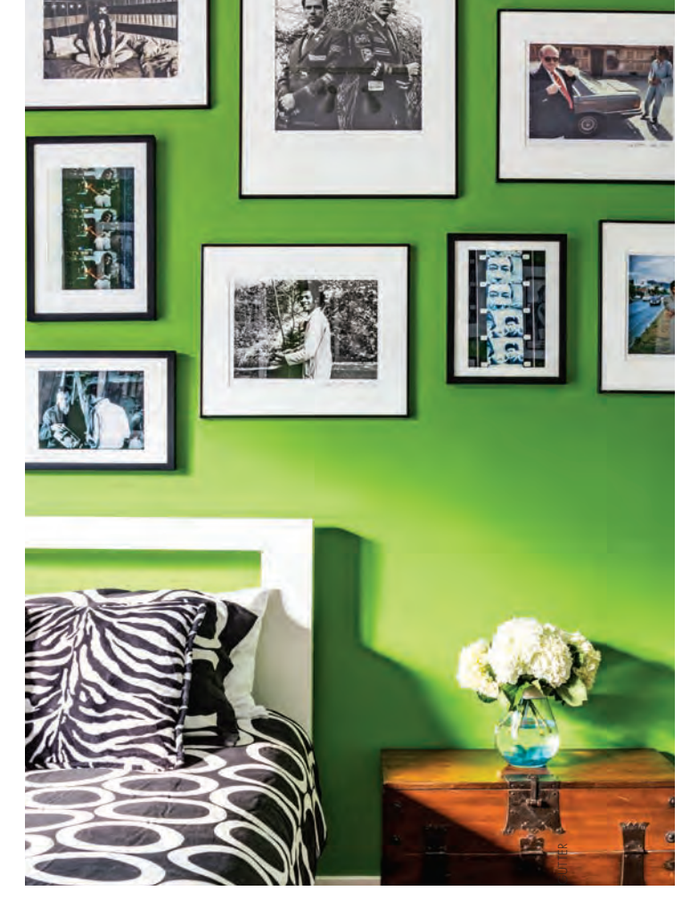
100 HOUSTON SEPTEMBER 2014